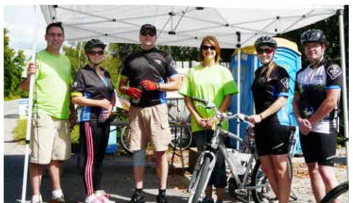
Participants pause at the water station.

SAVE THE DATE • Friday, September 9th, 2016