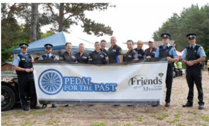
The 80k Oro Hills Challenge participants pause for a photo with our Auxiliary members prior to heading out.

Just over half of the participants chose to ride either the 50-kilometre route or the more challenging 82-kilometre 'Oro Hills Challenge' on pavement. The rest tried out their skills on the trails of Hardwood Ski and Bike, the site of the mountain bike races for the Pan Am Games this past summer.