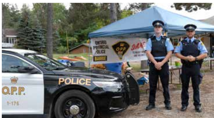
Special thanks to our Auxiliary members, Barrie Detachment, for their continued support of Friends' events.