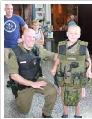
A future recruit tries on some TRU gear for size.