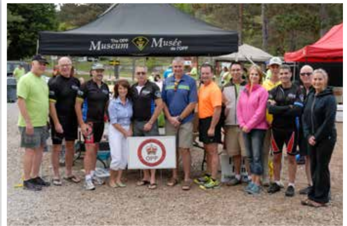
COA members and their families were well represented at the Pedal for the Past event. In total, 12 commissioned officers participated.

The tour started with an address by the Commissioner highlighting new initiatives and technology being implemented. The day was best summed up by two of our Vets, who wrote: "Thank you so much for arranging and shepherding the Vet's tour today. It is so true that us retirees continue to serve as ambassadors for the OPP. Today's tour provided up-to-date information that was in fact inspiring and made me proud all over again to have been a part of a progressive and forward-thinking