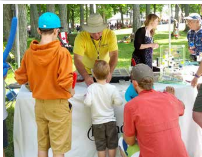
Many Friends volunteers and Museum staff helped out with activities (OPP uniform dress up, button making and card crafting) in the Folk Play area at the Mariposa Folk Festival in Orillia's Tudhope Park on July 4th and 5th.