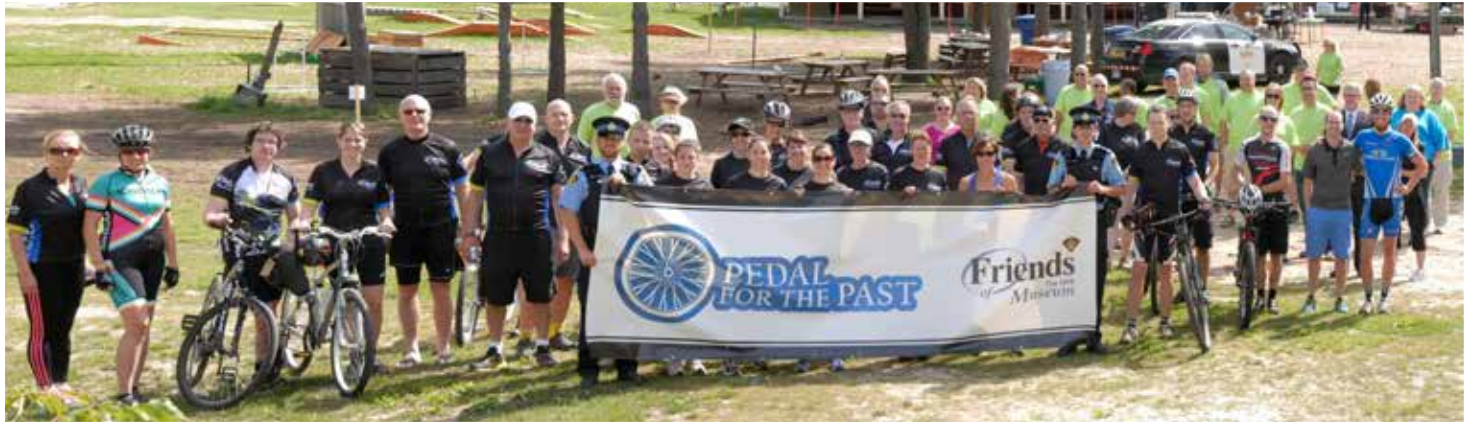
Participants in the 50k road ride, mountain bike challenge and run gather with event volunteers at Hardwood Ski and Bike.

On September 11, after a mist of morning rain, almost 50 cyclists, runners and walkers teamed up at Hardwood Ski and Bike to enjoy a picture-perfect fall day in the hills and rustic scenery of Oro-Medonte to help raise over $20,000 in The Friends of The OPP Museum's fifth annual Pedal (and Run) for the Past (P4P) fundraising event. Seeing so many enthusiastic cyclists on the roads of Oro and the Hardwood trails wearing the Friends cycling jersey was a stirring sight and raised the profile of the Friends and the Museum.