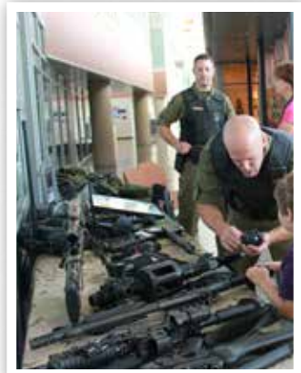
TRU members set up a display featuring their specialized gear to share with visitors.