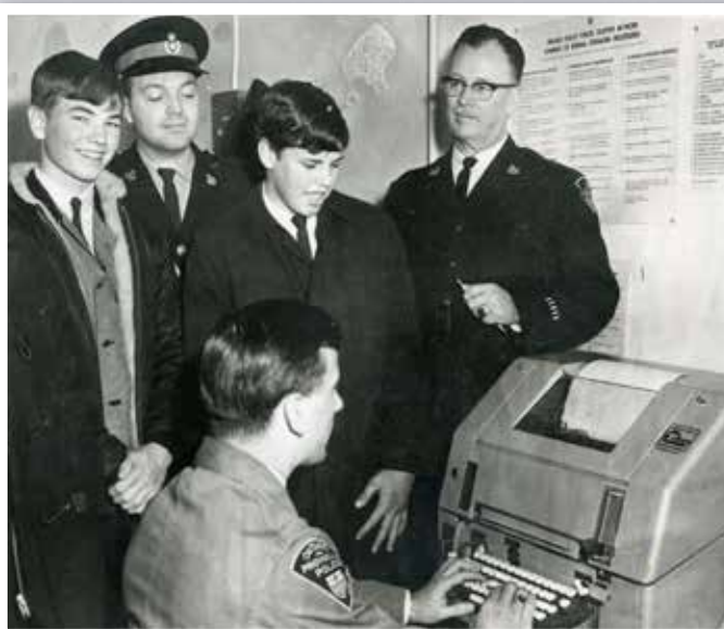
The Telex demonstrated to keen visitors. (2015.25.1)